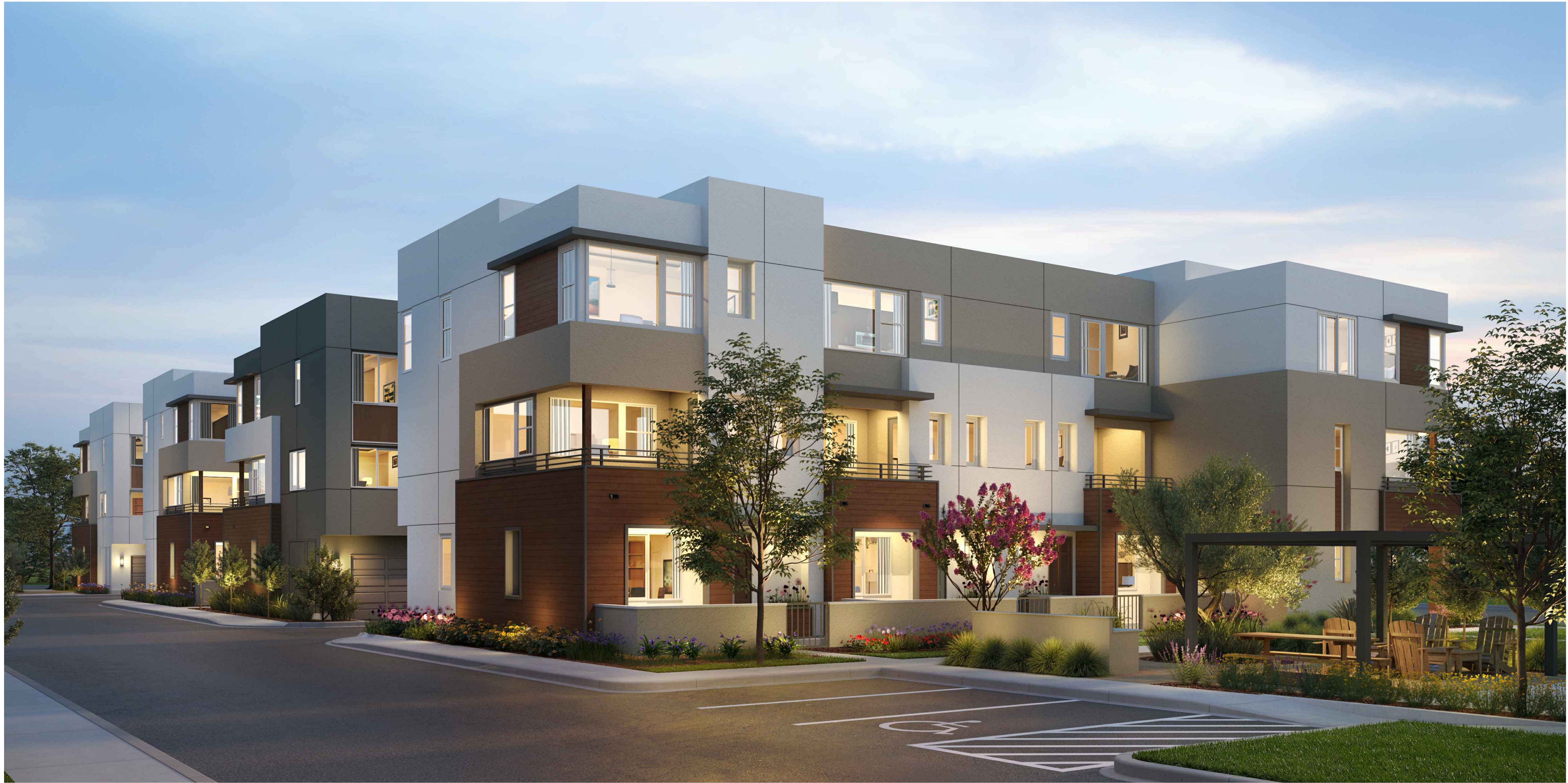
VIEW LOOKING DOWN PRIVATE DRIVE A TOWARDS BUILDING 10