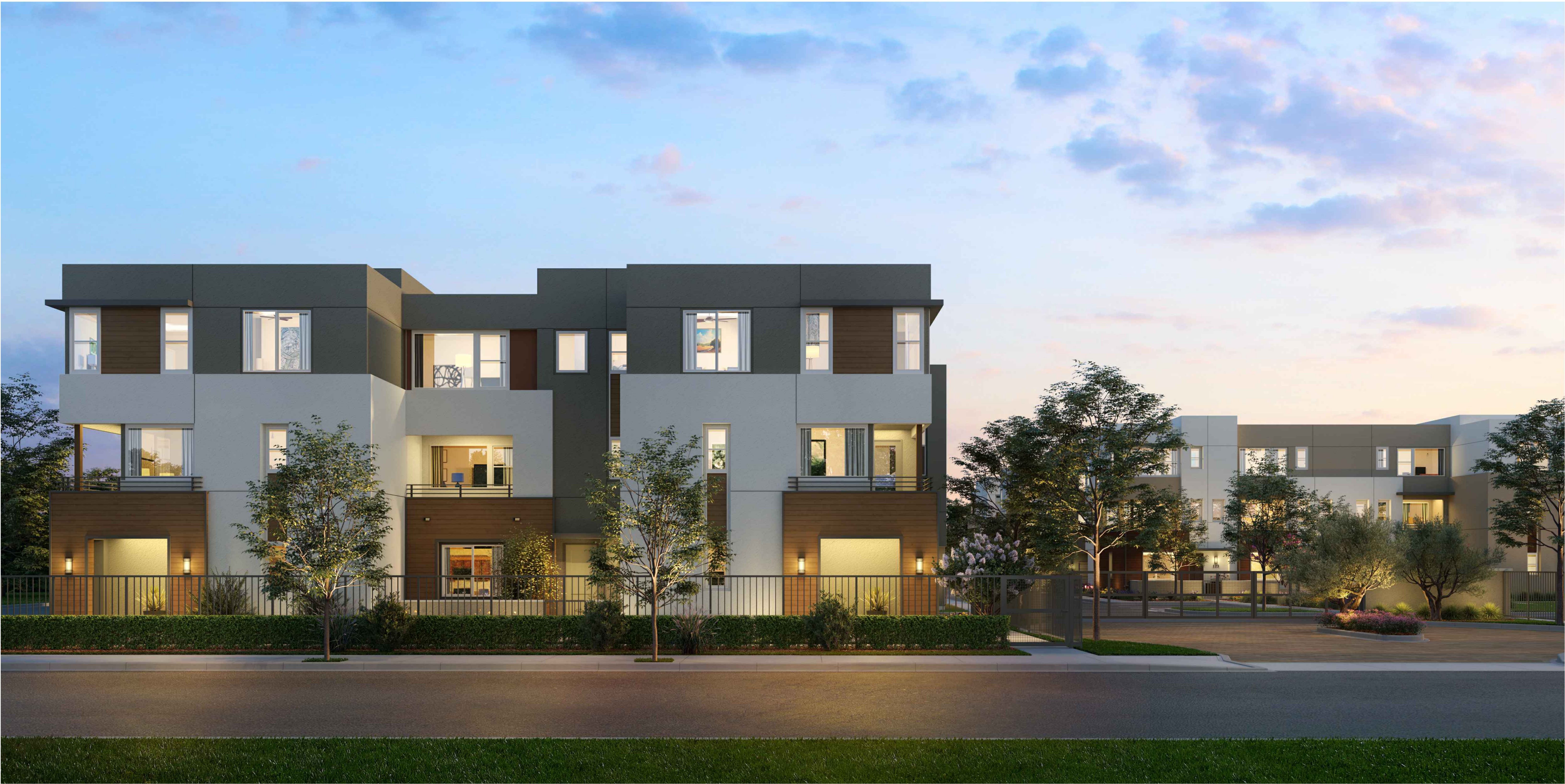
STREET VIEW LOOKING EASTWARD FROM LYON STREET